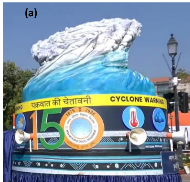
(a) The front section of the tableau highlights the Ministry's cyclone awareness efforts with a striking depiction of cyclone Dana , symbolizing the life-saving impact of timely warnings that ensured zero deaths .

It reflects the pivotal role of MOES in building resilience through accurate and timely services blending innovation with a human centric approach.