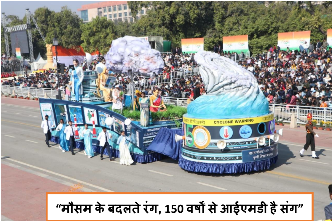
Tableau of India Meteorological Department (IMD), Ministry of Earth Sciences (MoES) in the Republic Day 2025 Parade magnificently depicted transformative contributions of IMD to the Meteorology and Society since 1875: Dr. Jitendra Singh

“मौसम के बदलते रंग, 150 वर्षों से आईएमडी है संग”